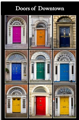
Doors of Downtown