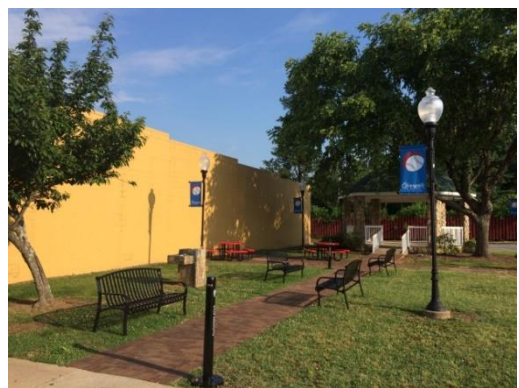
NEW FURNITURE & BANNERS IN THE MINI-PARK