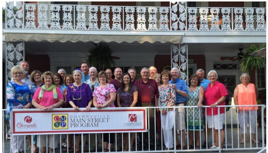
CMSP VOLUNTEERS AND SUPPORTERS CELEBRATE A HIGHLY SUCCESSFUL YEAR.

Number of Nationally Accredited Main Street cities (including Cherryville ) in North Carolina