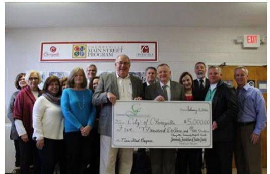
CMSP RECEIVES A $5,000 GRANT FROM THE COMMUNITY FOUNDATION OF GASTON COUNTY

A major benefit of our City's main street program is the donor support we receive from the state, businesses, private organizations and citizens. In FY 2016, the City of Cherryville realized a 1.17:1.00 ratio of donor to public investment. With the addition of imputed labor, the ratio is 2.25:1.00. Thus, every $1.00 the City spent on CMSP projects returned $2.25 in donations, pledges, and labor.