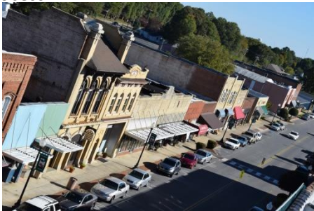
HISTORIC BUILDINGS LINE MAIN STREET

The City of Cherryville, building on Cherryville's designation as a North Carolina Main Street Community is now applying for the designation of our entire downtown business district as a National Historic District. The CMSP Economic Restructuring Work Group is tasked with overseeing this, and will help facilitate the process.