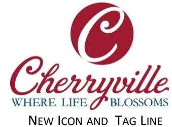
NEW ICON AND TAG LINE

Have you noticed the new signage on City trucks lately? The City of Cherryville is promoting its new brand with new signage on utility vehicles. Cherryville, Where Life Blossoms is the new tag line for our City. You can see it also on the downtown banners. The City has purchased new decals for all vehicles. Police and City vehicle signage will be updated soon to complete the new look.