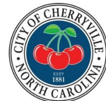
NEW CITY SEAL

The City is also installing the new framed City Seal in City Hall, the Community Building and various City departments. The seal was redesigned by Arnett-Muldrow, the branding company, and presents a more professional, uniform look throughout the City. The old City Seal will be donated to the Historical Museum.